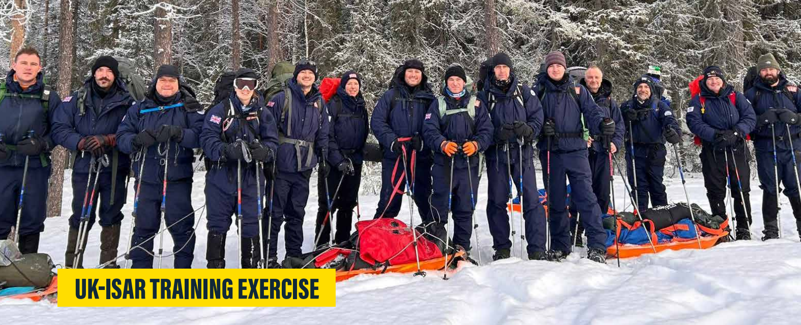
UK-ISAR TRAINING EXERCISE