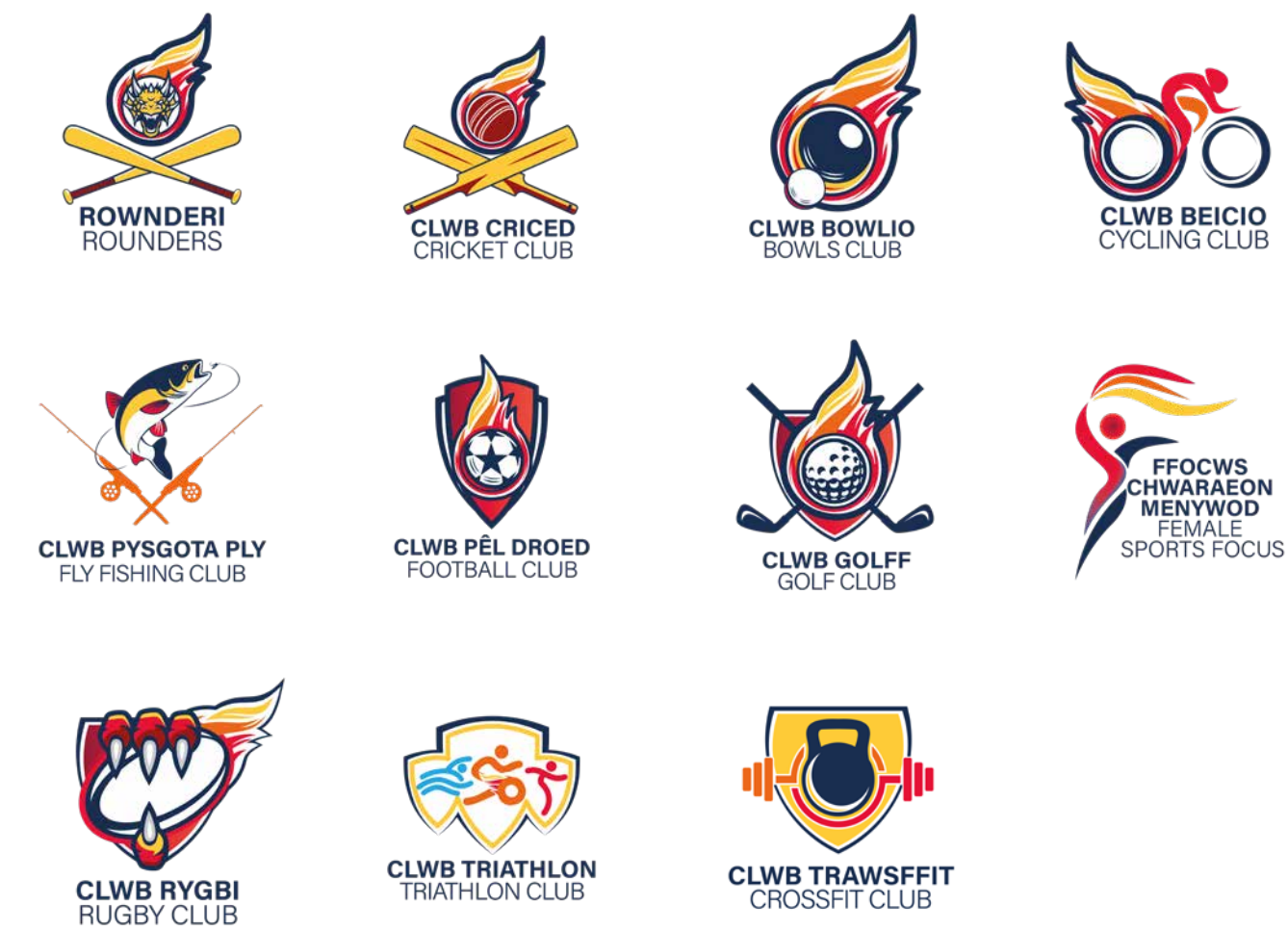
These are the official Sports and Social club section logos – for any logo enquires please contact our graphics team

The Sports and Social Club is a platform for keeping active, socialising, and having fun. Currently it consists of a variety of sections that you can join, including: